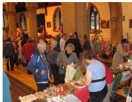
.....and once the doors were open in they came.